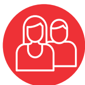
men & women