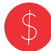
rich & poor

Depression does not discriminate; men and women, different ethnicities, rich and poor, are all susceptible.